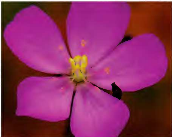
Figure 3: Glandular scape (left) and closeup of flower (right).